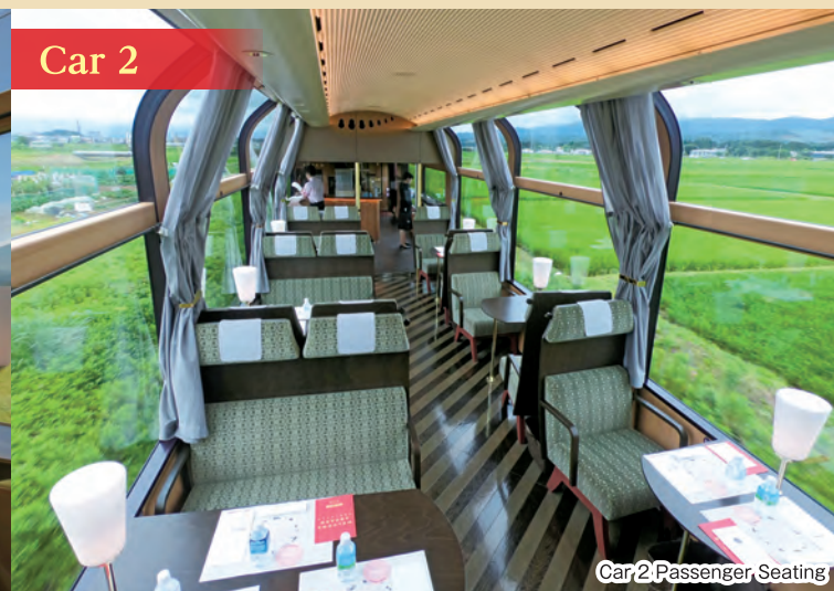
Car 2 Passenger Seating

Car 1 has a shiny gold lounge-style seating arrangement that faces the sea and mountains