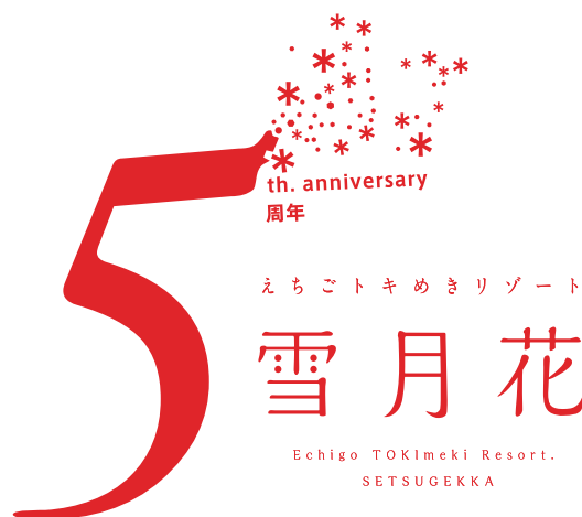
Information shown in this pamphlet is accurate as of May 2021. えちごトキめき鉄道株式会社 〒942-0003 新潟県上越市東町1番地1 新潟県知事登録2-390号 出 全国旅行業協会正会員 202105300500