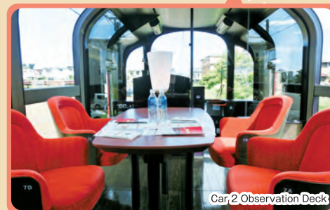
Car 2 Observation Deck