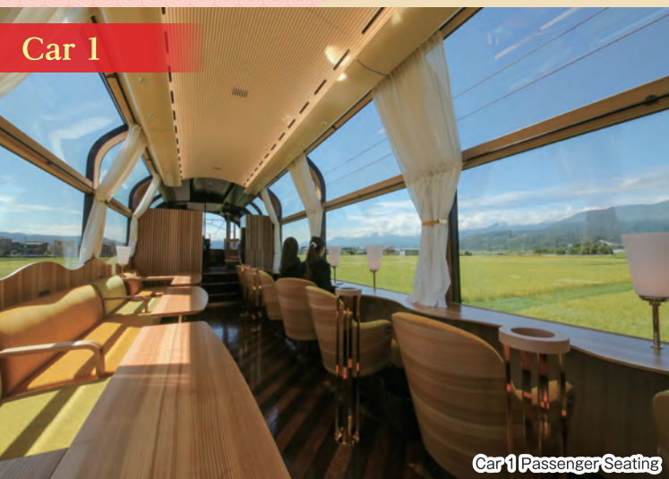
Car 1 Passenger Seating