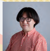
Head of Train Planning and Design for the Echigo Tokimeki Resort Setsugekka

Winner in the Design category of the SBID International Design Awards (held by the Society of British and International Design)・Silver award at the FDA Asia Design Award (held by the Hong Kong Designers Association)・Gold winner at the 10th IDA international Design Awards (USA)・Encouragement prize & judging committee chair's award at the Japan Wood Design Awards (held by the National Land Afforestation Promotion Organization and others)・2016 Good Design Award (held by the Japan Institute of Design Promotion)・Rural Creation Award at the Furusato Meihin of the Year (sponsored by the Cabinet Office; the Ministry of Agriculture, Forestry, and Fisheries; and the Ministry of Economy, Trade, and Industry)・Good Lighting Award (held by the Illuminating Engineering Institute of Japan)・2017 Laurel Prize (selected by the Japan Railfan Club)