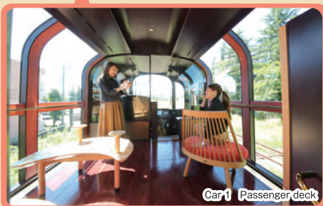
Car 1 Passenger deck

The elevated observation deck (Required additional charge) 4 Passengers